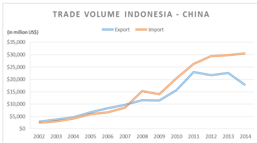
Figure 1. Trade Volume between Indonesia and China

Notes: 1) *: in million US$; 2) Sources: UN Comtrade, World Bank, Lab Komputasi Departemen IE FEB UI, and author's calculation.